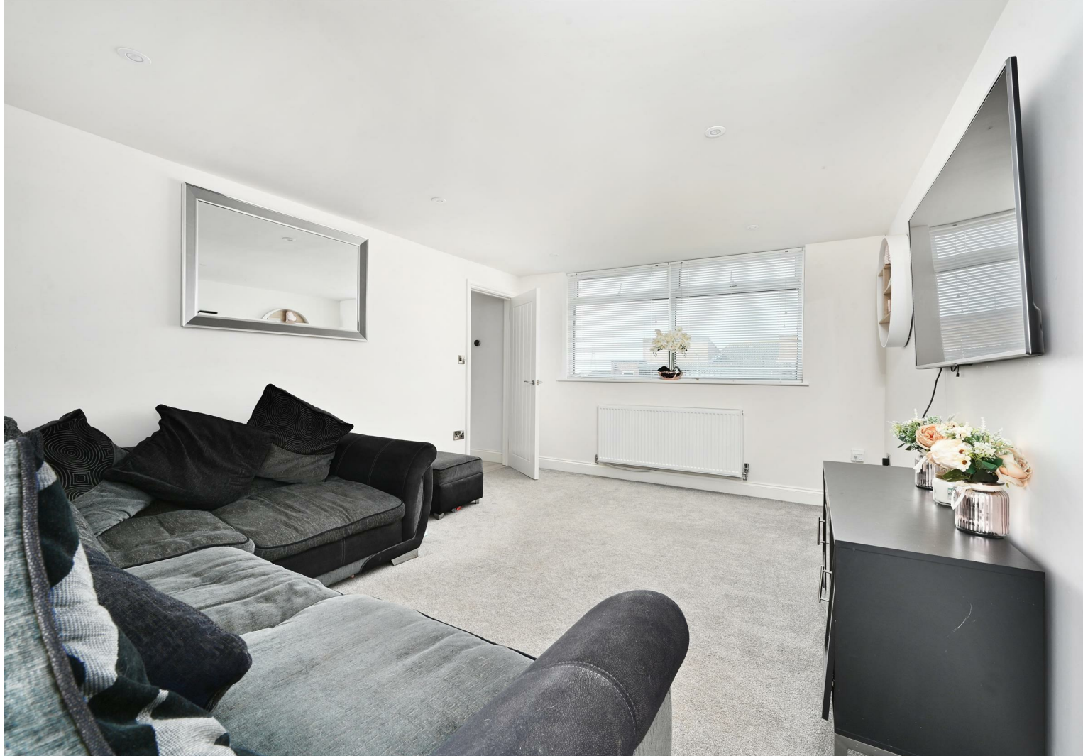
Locks Crescent, BN41 Approximate Gross Internal Area = 100 sq m / 1078 sq ft

Brighton & Hove City Council Tax Band: C